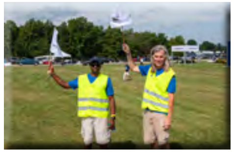
Volunteers are required at every Porscheplatz. These two worked parking Porsches in the corral. It was hot and humid, but there were breaks for water and cooling.