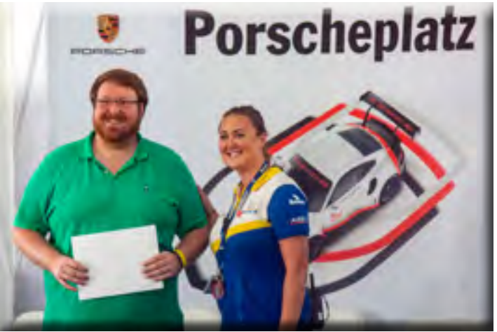
Hi everyone! We are at Hot Shots for food and golf. I won a set of Michelin tires at the VIR Porscheplatz.