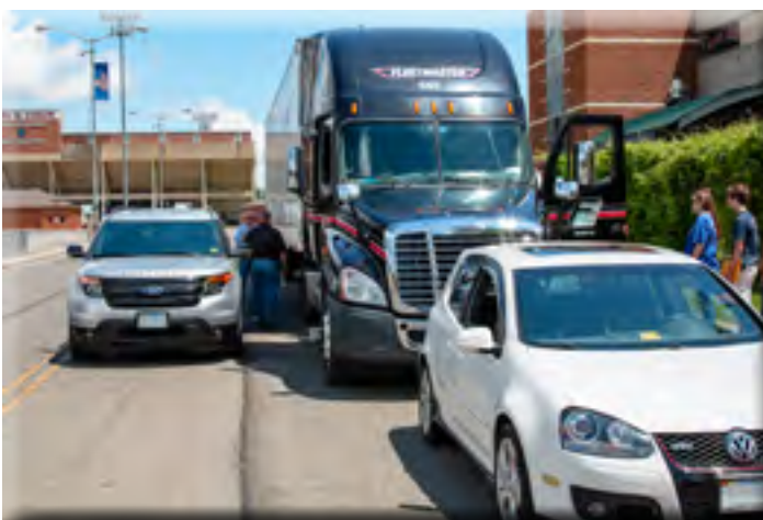
Do you wonder what a big rig driver can see when your car is near? Students got into the driver seat with cars around them as in typical traffic. Another driving hazard to be recognized in everyday driving.