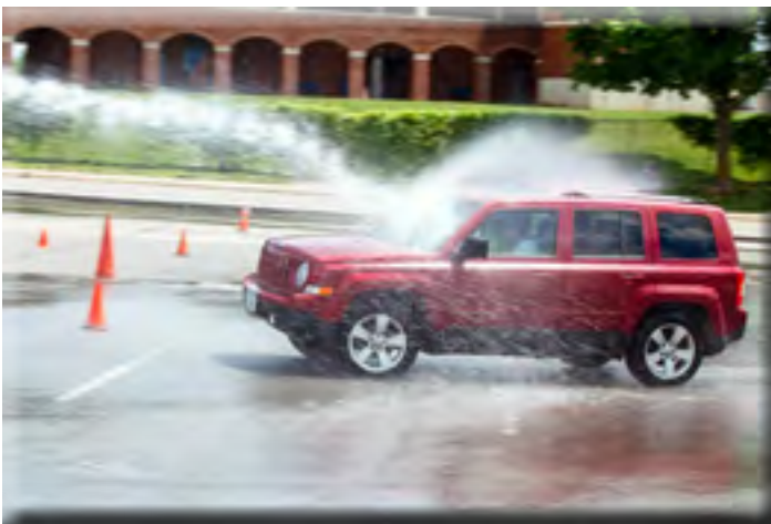
Driving on wet pavement and in heavy rain creates several driving hazards. This driver receives a heavy water blast to the windshield, much like a passing truck may send.

Thank you to the Salem Civic Center and Salem Fire Department, and our many dedicated volunteers.