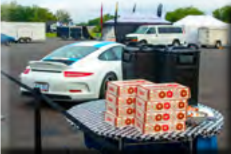
An early morning start with Porsche, doughnuts, and coffee at Virginia International Raceway. That is a great way to start the day!

allowed on the track for parade laps. Some said the speed on the track was too slow. But whatever the speed, parade laps are fun. Join us in 2019.