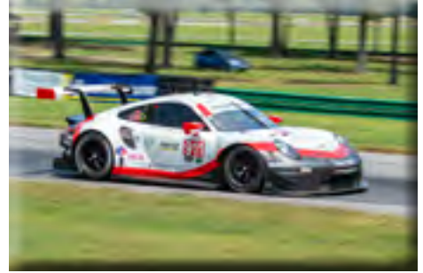
Porsche #911 on the track at Virginia International Raceway. Along with the sister car #912 their distinctive exhaust note means fans can hear them coming.