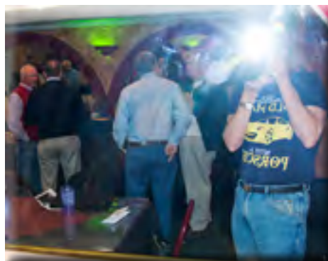
Reflecting on the previous year and anticipating the current year at the January planning session.