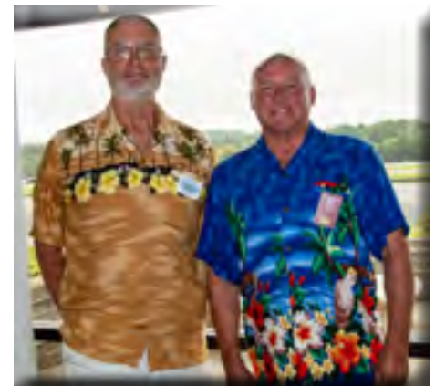
You never know what interesting people you will meet.