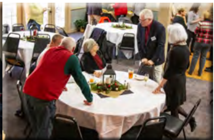
Menu choices come first at Old Oak Cafe. December Holiday Party at Westlake Country Club.