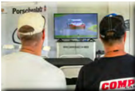
Inside the Porscheplatz tent there is closed circuit TV so fans can see what is happening on other parts of the track. The shade and cold beverages make a hot day more enjoyable.