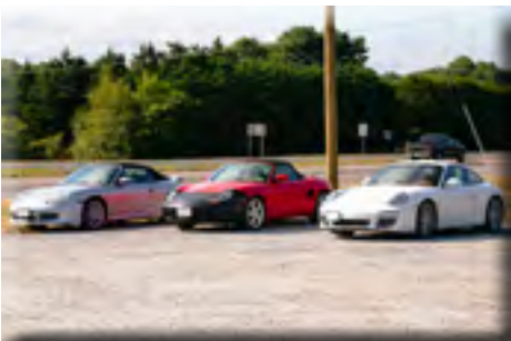
Which of these Porsches has the pole position at Colonial Restaurant?