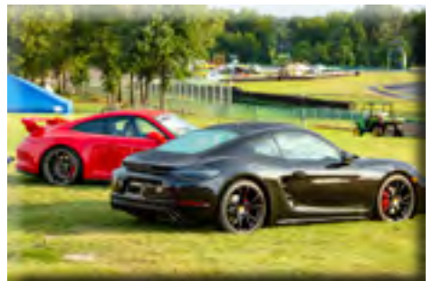
Between races there is time to view the newest Porsches. Porsche dealers support the Porscheplatz and add to the Porsche experience. Maybe get a new one next year?