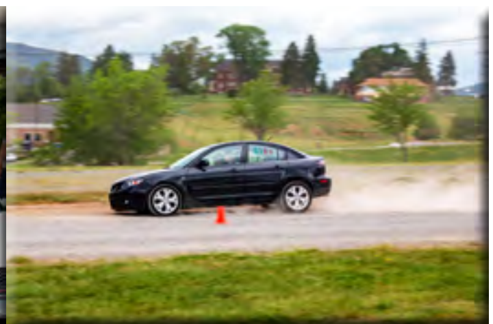
Two wheels off road is a driving situation too many drivers react to by swerving back onto the pavement and losing control. Inexperienced drivers are involved in serious accidents by not knowing how to respond.