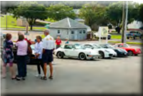
Members before entering Mac & Bob's, and their cars.

atmosphere and specialty. Not only are these brunches an excellent social opportunity, but a chance to learn more good places to dine. Many locations offer other things to do after eating. So drive your Porsche and join us. Casual is the word and good friends are there with you. Dates & places are on our website and Facebook page, and in Monday Morning Porsche Piddlings.