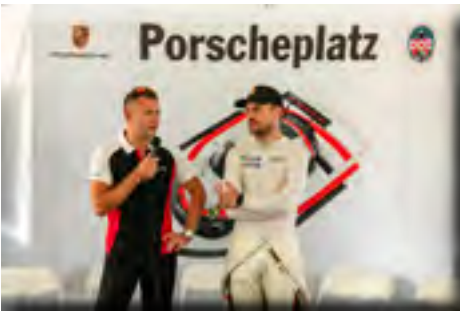
Every Porscheplatz has interviews and questions with team drivers. The technical and emotional parts of competition are most often discussed.