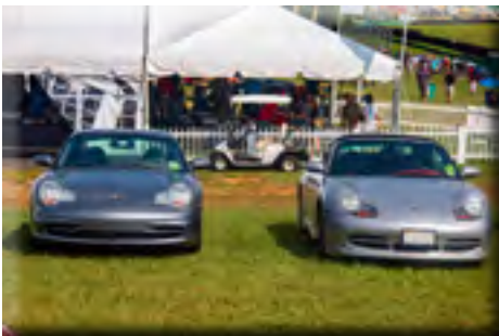
In the background, the large and comfortable Porscheplatz tent. In the foreground are two Porsches parked in the Porsche Corral. The view of the track is very good.