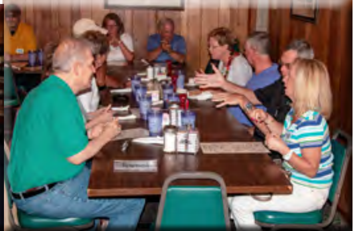
We intercepted NC invaders at Chateau Morrisette. Good conversation while waiting for food at Hale's.