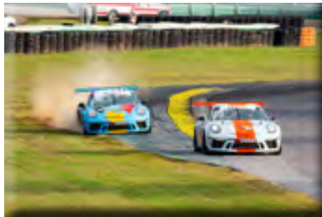
During the GT3 Cup race at Virginia International Raceway one car "mows the grass" after running off track in the turn. Sights like this make the racing exciting.