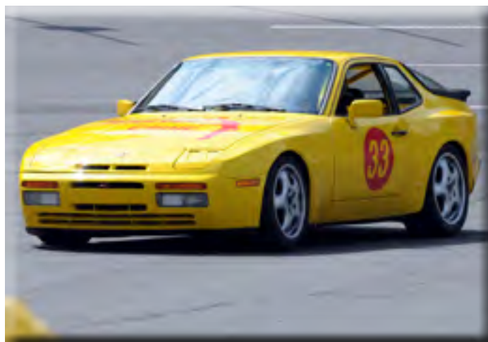
Another view of our new president in this 2010.