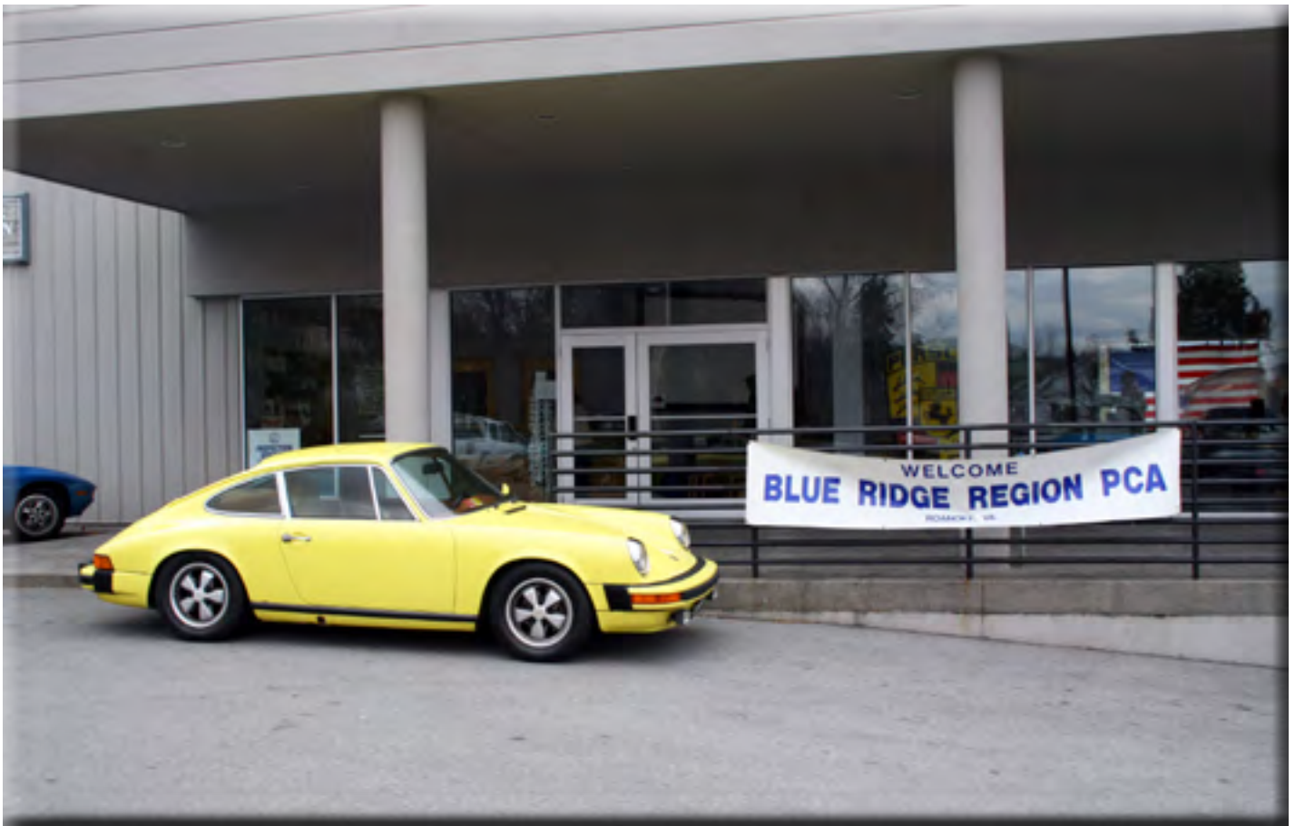
A vintage 911 sits outside Martin's German Service during one of our events in 2007.