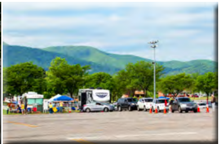
Cars preparing for the next exercise. While there is a break in the action, the views provided a beautiful backdrop for parents and others. The facilities inside provided a place to rest.