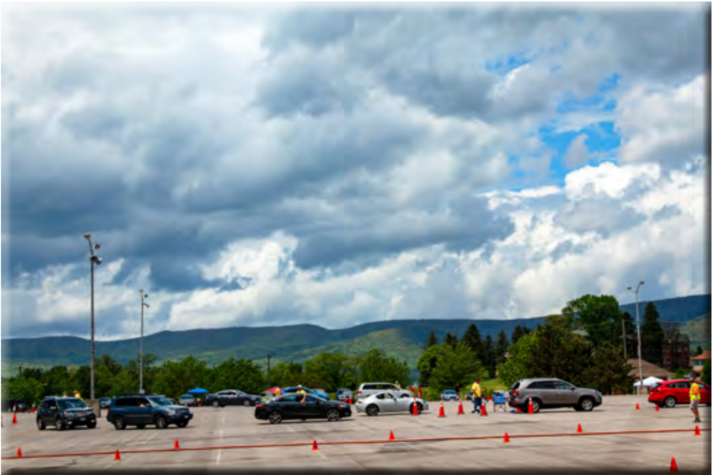
The Blue Ridge Mountains gave our region its name and provide beautiful scenery.