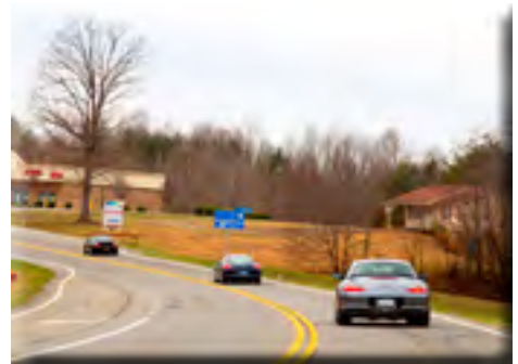
Going to an event is part of the fun.