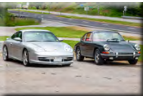
Something new and something old. A lot of changes have been made over the years.